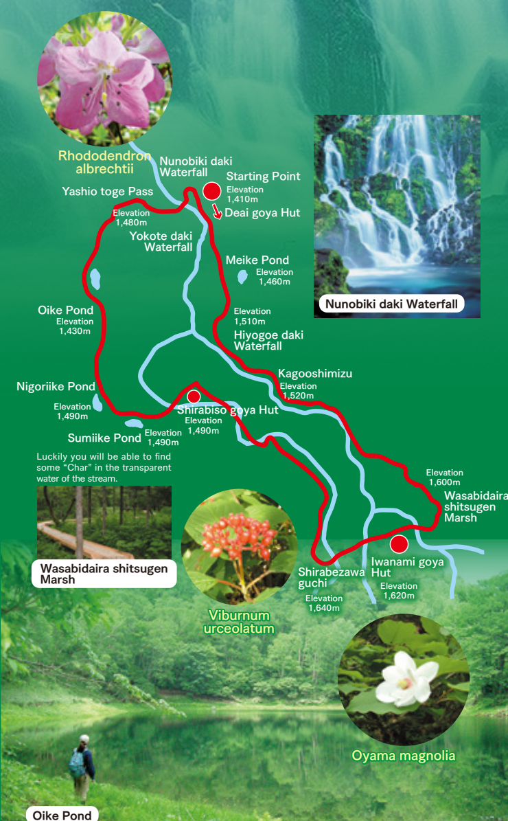
Wasabidaira shitsugen Marsh

Luckily you will be able to find some “Char” in the transparent water of the stream.