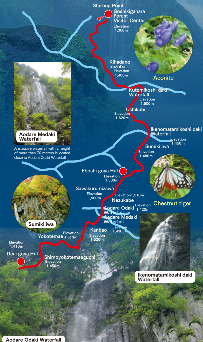
Aodare Medaki Waterfall

A massive waterfall with a height of more than 70 meters is located close to Aodare Odaki Waterfall